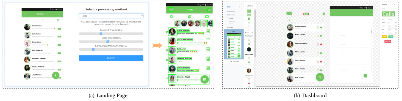
Figure 2: Illustration of our UIED web application.